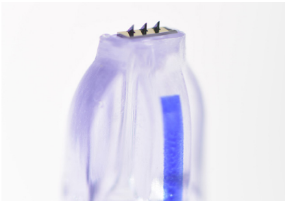
Figure 1a: View of Micron jets.

The MicronJet™ 600 system use The area to be injected is marked and cleaned with a proprietary disinfection