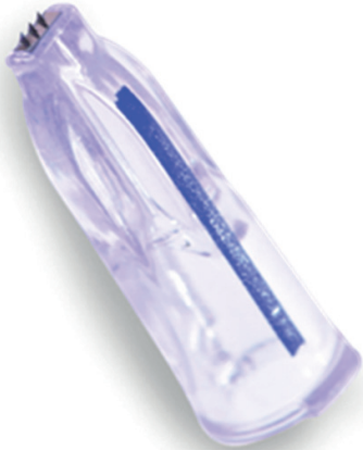
Figure 1b: MicronJet™ Hub.

Once in the skin the plunger can be depressed to administer a small bleb or